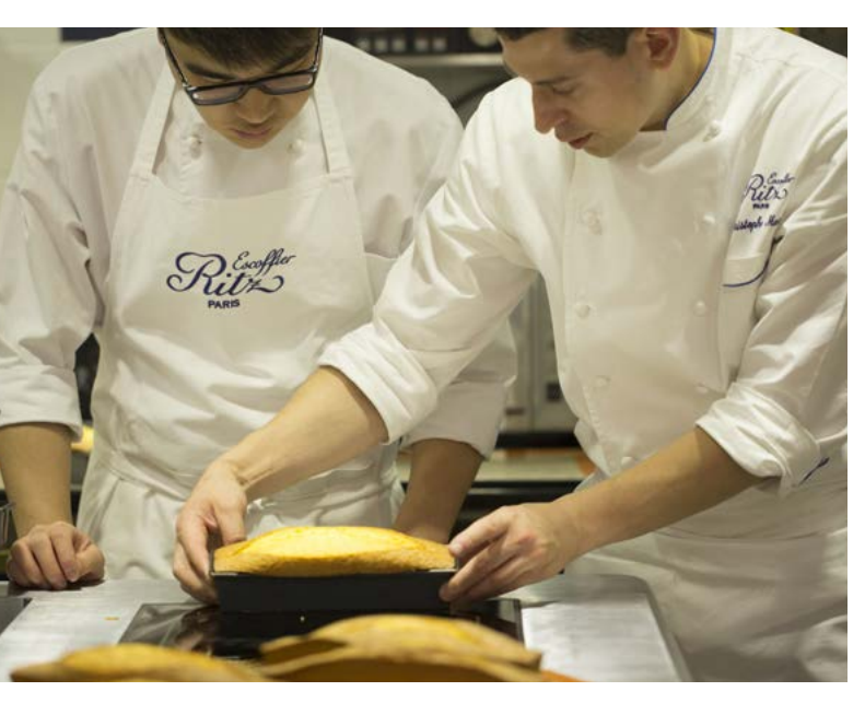
A student on his one-week field trip to the Ritz Escoffier School